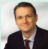
Wolfgang Urbantschitsch E-control